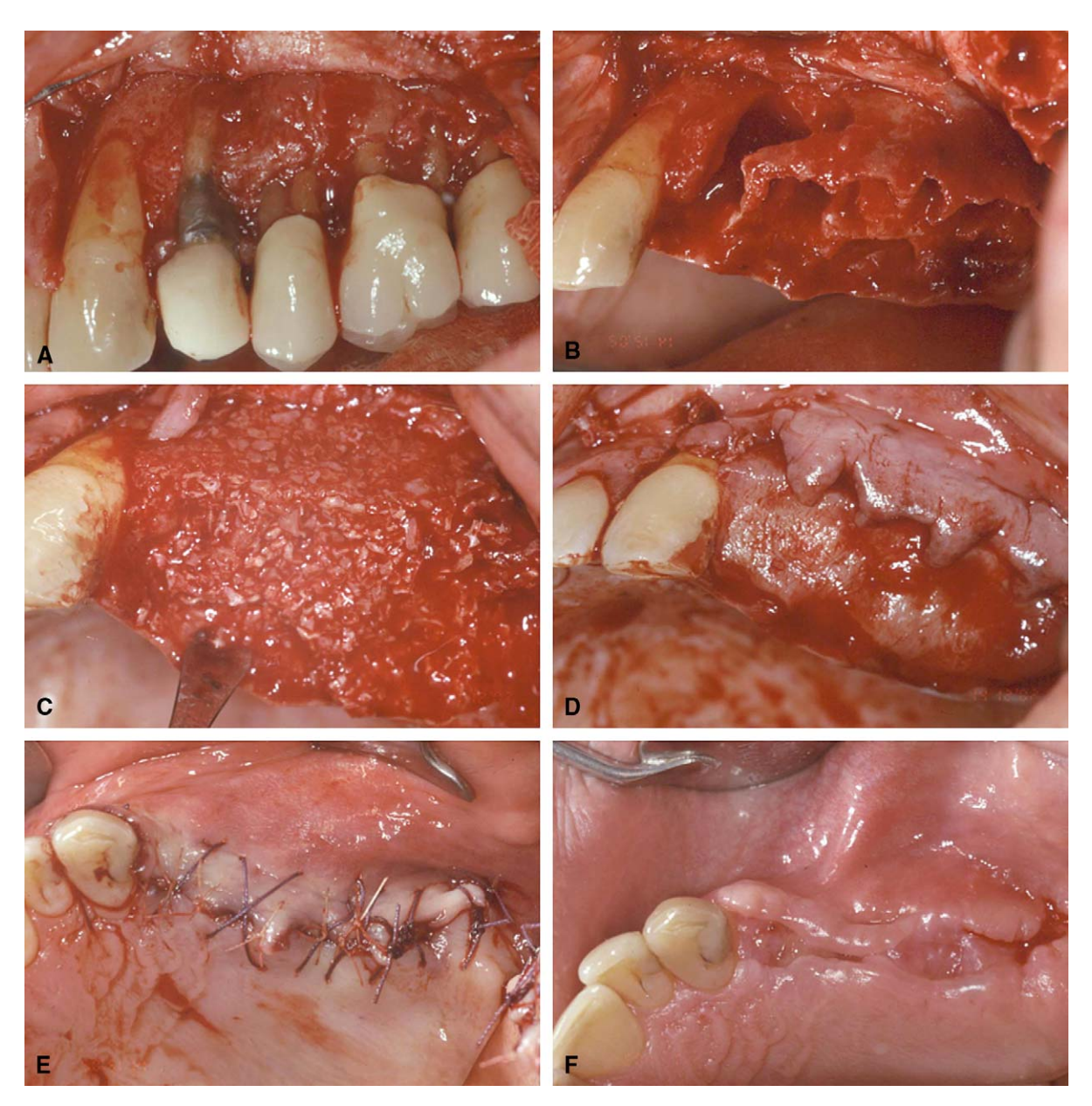
Fig. 1. Tooth extraction and osseous filling in a case of terminal periodontitis of wide sites ( A and B ) are delicate interventions because of the difficulty in obtaining soft tissue coverage on the surface of the osseous injury. Sockets are filled with Phoenix allogenic bone (TBF, France), ( C ). The use of PRF as cover membranes ( D and E ) permits a rapid epithelialization of the surface of the site, neutralizing the infectious phenomena. Forty-eight hours postoperative, wound is totally closed and sutures are removed ( F ).

the transplantation of these cells. Several authors have demonstrated that a fibrin matrix is an optimal support to transplanted mesenchymal stem cells for obtaining osseous defect regeneration. <sup>22-24</sup>